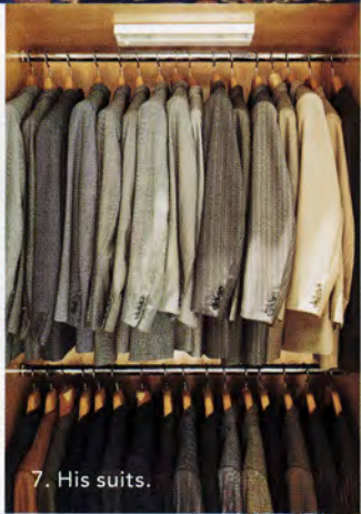
7. His suits.