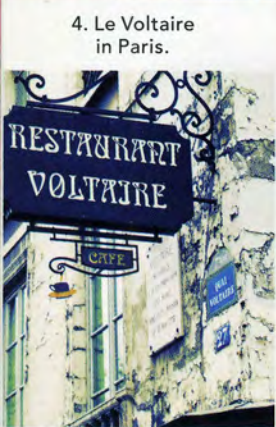
4. Le Voltaire in Paris.