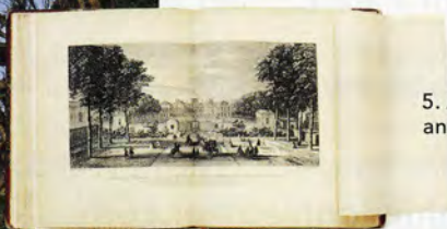
5. A treasured antique book.