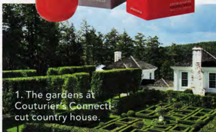
1. The gardens at Couturier's Connecticut country house.

12 / SUGAR Life is not worth much without that either.