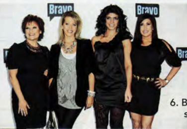
6. Bravo TV stars.